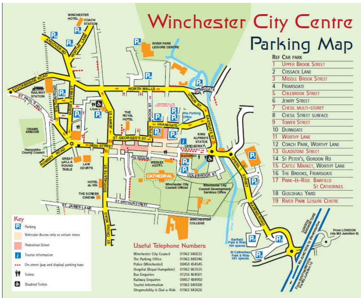
Map of Winchester